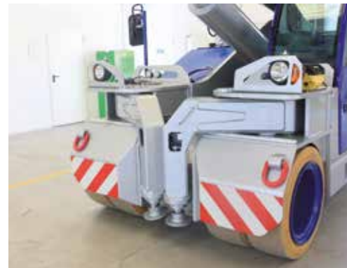
FRONT OUTRIGGERS (OPTIONAL)