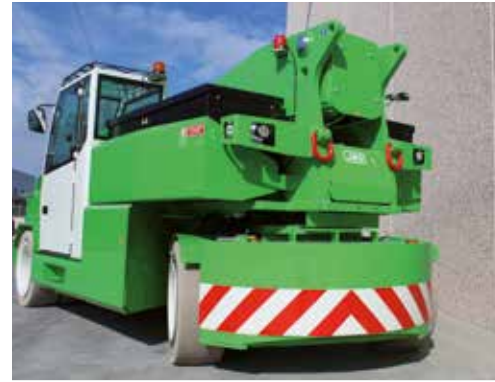
ARTICULATED REAR GROUP